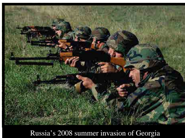
Russia's 2008 summer invasion of Georgia

The recent Russian-Georgian conflict brought to the forefront several important international issues, not least the thorny problems concerning Russia's energy clout and the European Union's energy vulnerability. It became increasingly clear that Russia has no intention of becoming a passive or marginalised power. Indeed, for the last two years Russia has constantly challenged US and Western domination