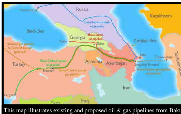
This map illustrates existing and proposed oil & gas pipelines from Baku

We also have to consider the threats to existing pipeline routes. The Russia-Georgia conflict raised considerable concern over the security of pipelines running across the former Soviet Republic. Indeed, BP was forced to shut down two of its three pipelines running through Georgia during the conflict. Furthermore, there have been concerns over the security of the Baku-Tbilisi-Ceyhan (BTC) pipeline, which pumps one million barrels per day to Europe through Turkey's Mediterranean seaport of Ceyhan 3 . With Kurdistan Workers Party (PKK) guerrillas in active pursuit for any opportunity to sabotage Turkish installa-